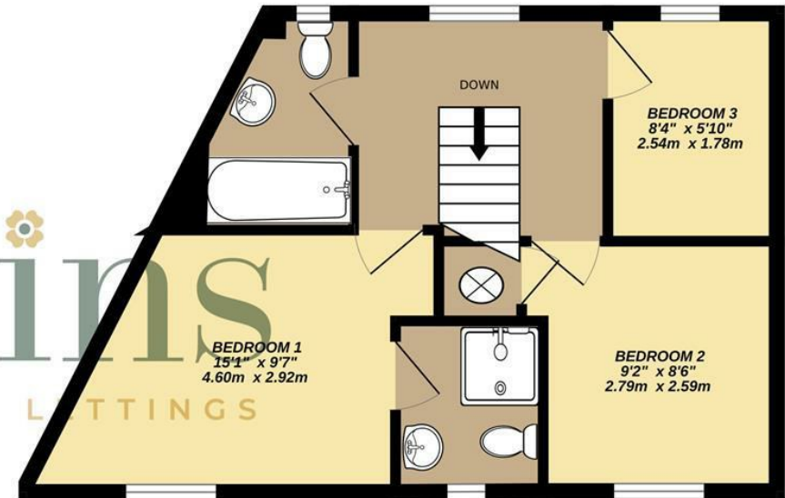
1ST FLOOR 401 sq.ft. (37.3 sq.m.) approx.